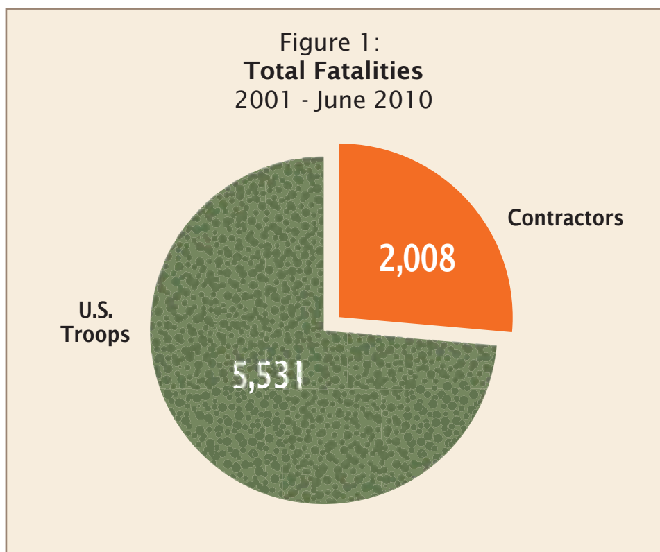
Figure 2: Total Fatalities / 2001 - June 2010

That's because, as of June 2010, more than 2,008 contractors have been killed in Iraq and Afghanistan. Another 44 contractors killed were in Kuwait, many of whom supported the same missions. On top of that, more than 44,000 contractors have been injured, of which more than 16,000 were seriously wounded (see Figure 3). While these numbers rarely see the light of day, Figure 1 reflects the