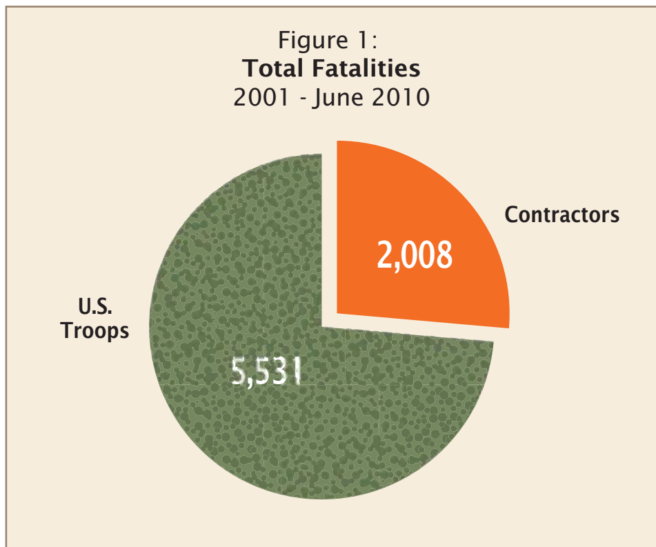
Figure 2: Total Fatalities / 2001 - June 2010

That's because, as of June 2010, more than 2,008 contractors have been killed in Iraq and Afghanistan. Another 44 contractors killed were in Kuwait, many of whom supported the same missions. On top of that, more than 44,000 contractors have been injured, of which more than 16,000 were seriously wounded (see Figure 3). While these numbers rarely see the light of day, Figure 1 reflects the