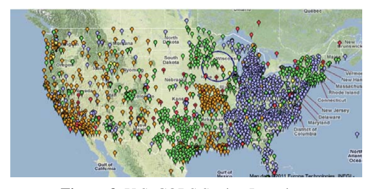
Figure 3. U.S. CORS Station Locations

High-precision receivers are also used in many state and local networks. The National Geodetic Survey (NGS), an office of NOAA's National Ocean Service, manages a network of Continuously Operating Reference Stations (CORS) that provide Global Navigation Satellite System (GNSS) data consisting of carrier phase and code range measurements in support of three dimensional positioning, meteorology, space weather, and geophysical applications throughout the United States, its territories, and a few foreign countries. The sites are independently owned and operated. Each agency shares their data with NGS and NGS in turn analyzes and distributes the data free of charge. As of May 2010, the CORS network contains over 1,450 stations, contributed by over 200 different organizations, and the network continues to expand (See Error! Reference source not found.) .